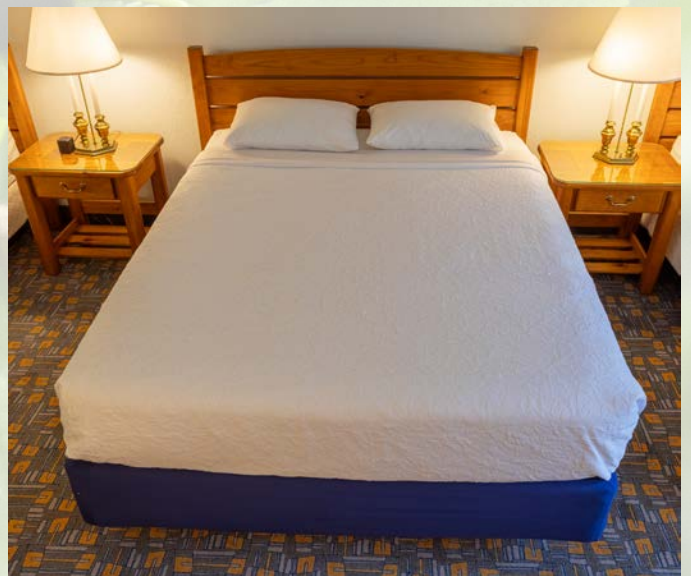
Bauer guest room after (sample of new bedding that will be added soon)