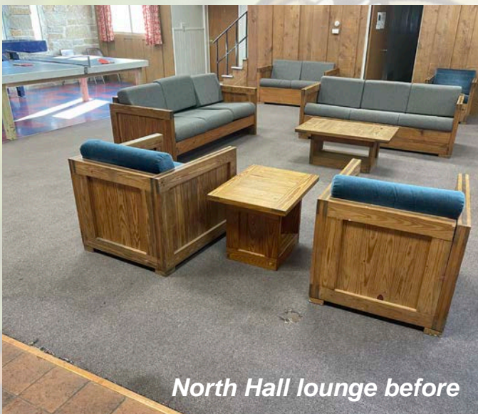
North Hall lounge before