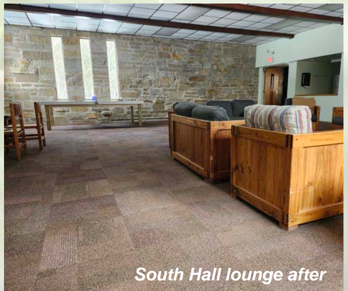
South Hall lounge after