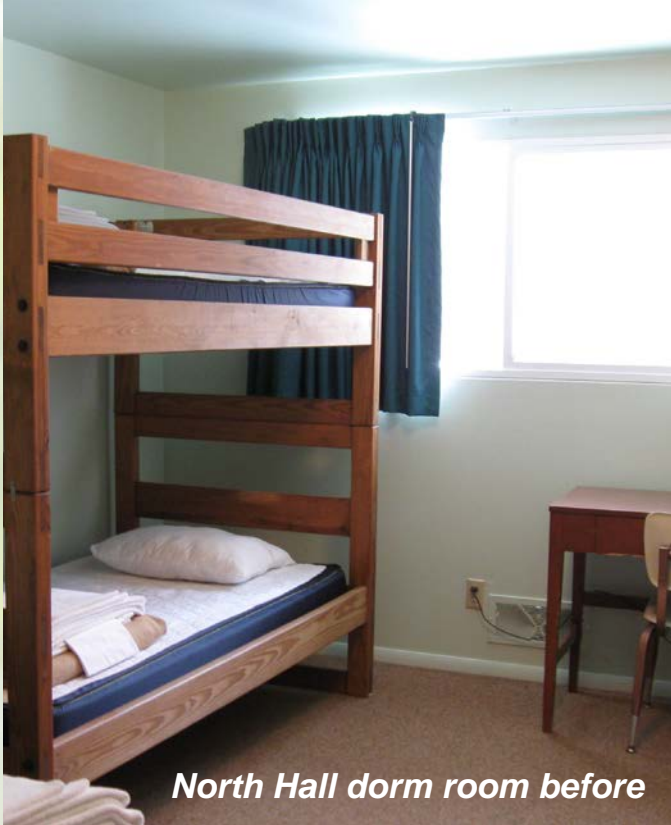
North Hall dorm room before

New carpet installed in Robbins North and South Halls dorms