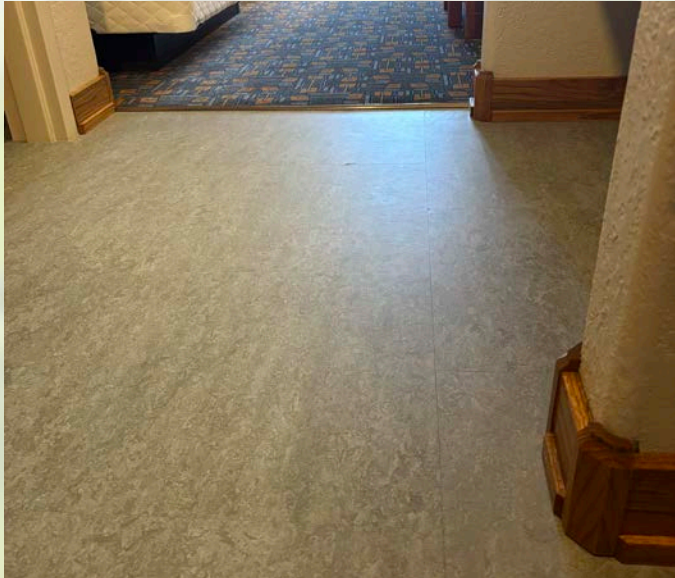
New marmoleum floors in bathrooms

Bauer Lodge has been transformed with new carpet, paint, bathroom floors and oak baseboards