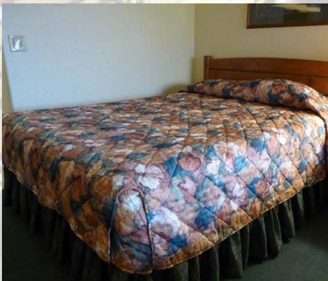
Bauer guest room before