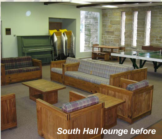
South Hall lounge before