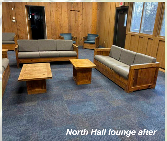
North Hall lounge after