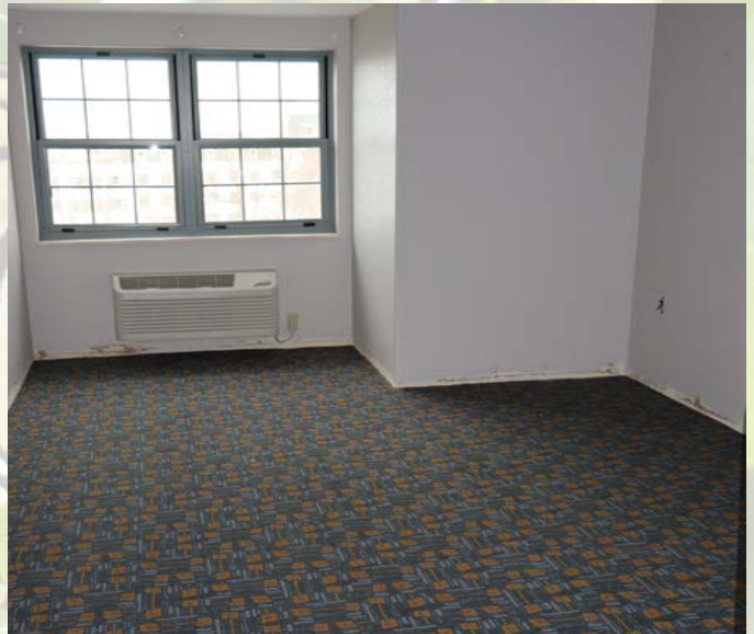
New carpet in guest rooms